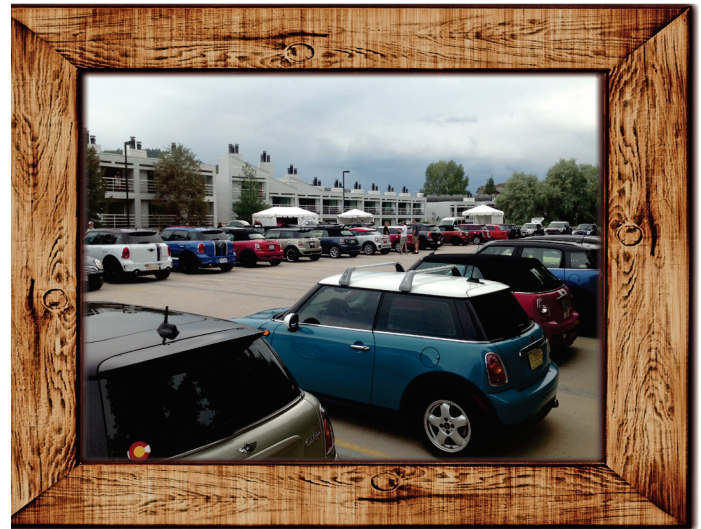
Minis on the Christie Lodge parking structure

The Christie Lodge served as headquarters and hosted over one hundred Mini Coopers during the MINI5280 event in August. The club and drivers were wowed by our accommodations, excellent guest service and the special car wash stations that were provided. The group utilized our conference room space and had full access to the upper parking deck for vendor set up and additional gathering space.