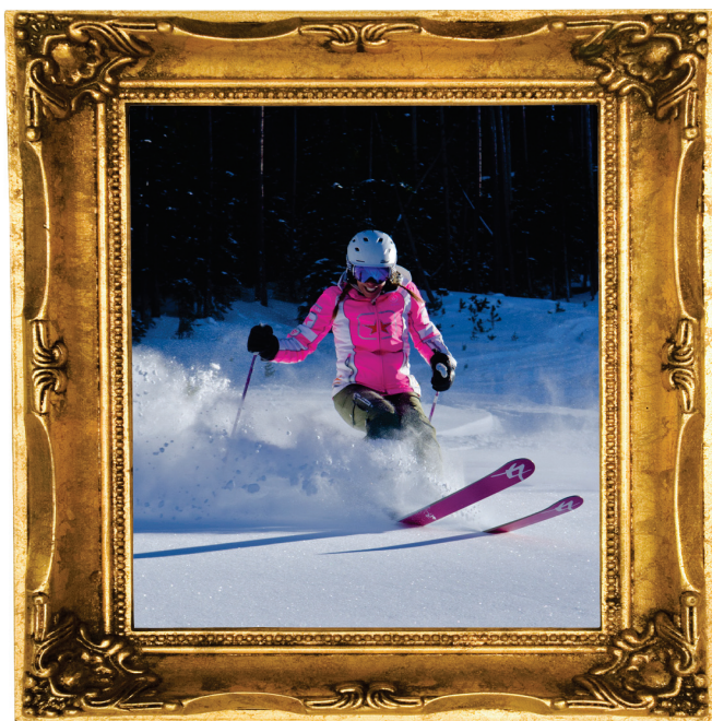
Women's Social Ski Tour

Accessing the ski slopes and Children's Ski School is even easier this season thanks to the addition of an escalator located in the heart of the Beaver Creek Village above the ice rink. Another new addition is the Talons restaurant, it replaces Red Tail Camp and has 500 indoor seats, 250 outdoor seats and serves skiers and snowboarders in the area of Larkspur Bowl, Grouse Mountain and Birds of Prey. Talons features The Brink Bar, a BBQ smokehouse, a new European-inspired gourmet menu and a stunning view to take in while you enjoy your meal.